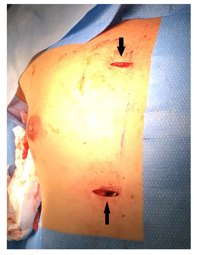
Fig. 1 - The picture is showing the two last incisions. The upper arrow in pointing out the last incision and the lower arrow is pointing out the second incision.

Between September 2016 and March 2017, 18 patients with indication for primary and secondary prevention of SCD, with no concomitant indication for artificial cardiac pacing for the treatment of symptomatic bradycardia, cardiac resynchronization therapy and/or antitachycardia therapy, were included. After S-ICD potential benefits had been presented to the patients and accepted by them, the patients were submitted to the screening phase by validating the QRS complexes through a specific ruler designed for this purpose. The procedure was performed in the operating room under general anesthesia. After antisepsis and surgical fields positioning, three incisions were made in the first 15 patients and just two incisions in the last three patients. The first one to create