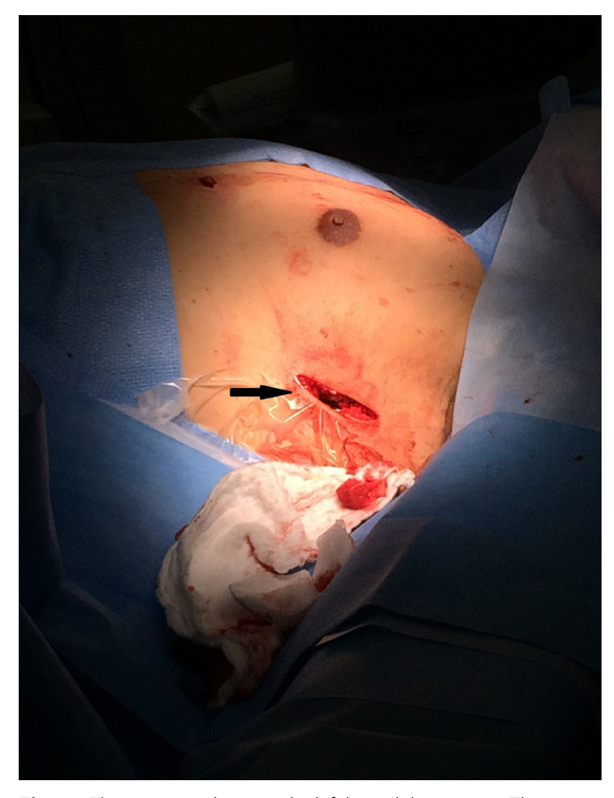
Fig. 2 - The picture is showing the left lateral thorax view. The arrow is pointing out the first incision.

The implantation of the S-ICD was successfully performed in the 18 patients, four female and 15 male, with mean age 52\pm12 years, and mean EF 48\pm11.8\% (Figures 3 and 4). Four