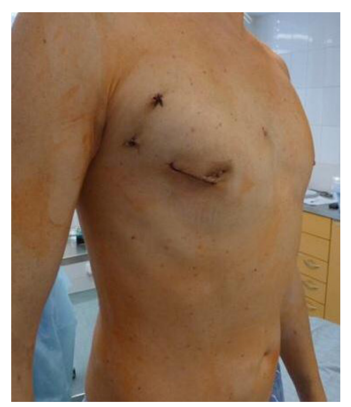
Fig. 2 – Mitral valve replacement via minithoracotomy: a final view.

AKI=acute kidney insufficiency; MT-MVR=mitral valve replacement via minithoracotomy; S-MVR=mitral valve replacement via sternotomy