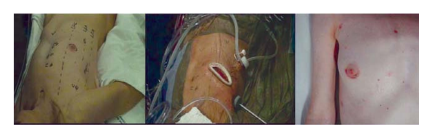
Fig. 2 – Preoperative marks, transoperative aspect and evolution of the periareolar wound in 30 days

trigone and the third in the posterior region of the mitral annulus and exteriorized through the minithoracotomy with the aim of rectifying the valve. We opted for the preservation of this valve using the technique of implantation of neochordae of PTFE, with pre-measured loops of Gore-tex® wire - CV5 [1]. Using a specific meter (Geister, inc), the distance between the right plan of valve closure was measured in areas adjacent to non-